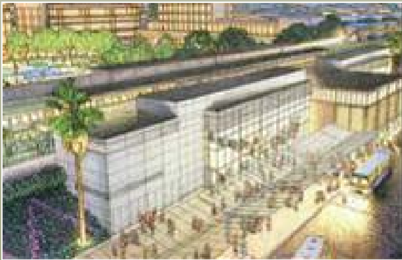
Union City, CA